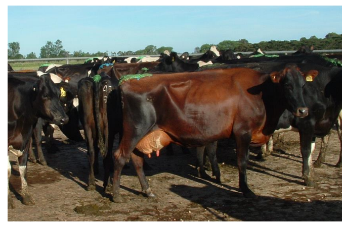
Fig. 3 Test Group Dairy Cow