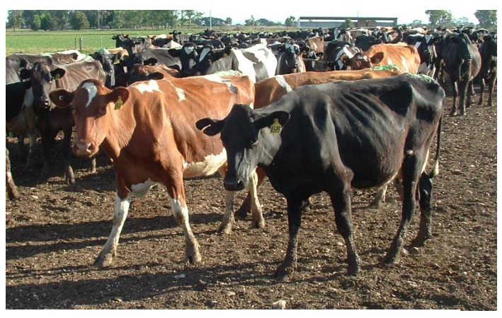
Fig. 2 Control Group Dairy Cow

Control group had more cost for the mastitis, milk production lose because of mastitis, and dead lose (Table 5). The control group lost about $4875, and the VTYEST group just lost $625, which meant the VTYEST group had $4250 profit than the control group.